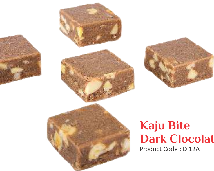
Kaju Bite Dark Chocolate