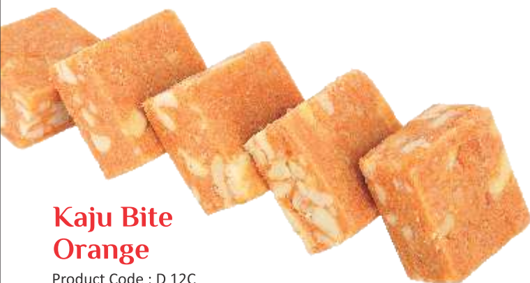
Kaju Bite Orange