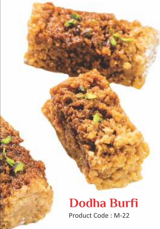
Dodha Burfi Product Code : M-22