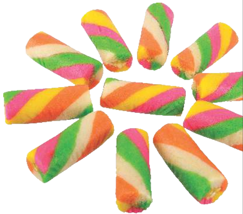
Kaju Indian Roll Product Code : D-35