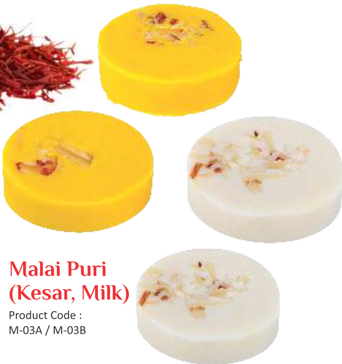
Malai Puri (Kesar, Milk)