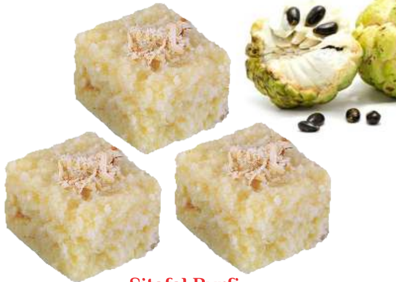
Sitafal Burfi Product Code : M-20