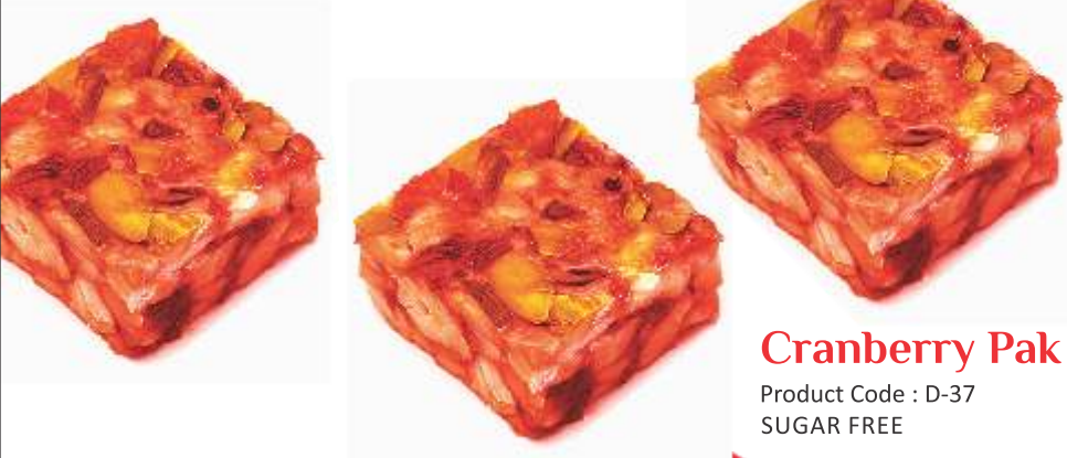
Cranberry Pak Product Code : D-37 SUGAR FREE