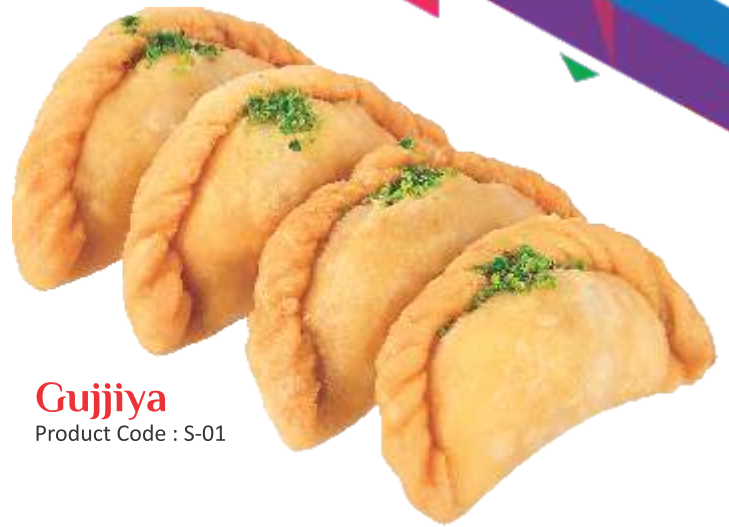
Gujjiya Product Code : S-01