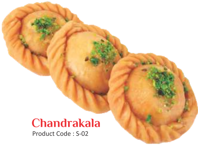
Chandrakala Product Code : S-02