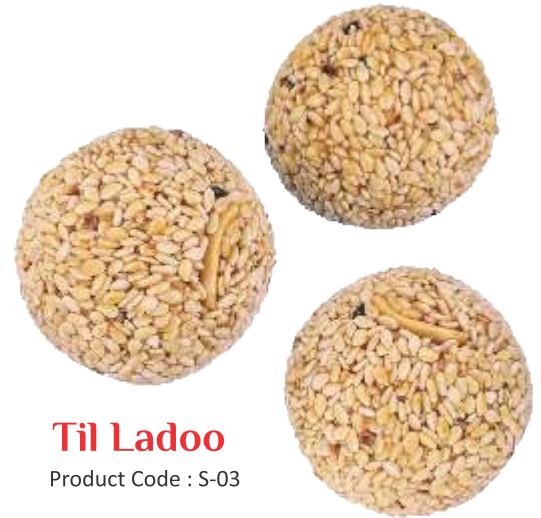
Til Ladoo Product Code : S-03