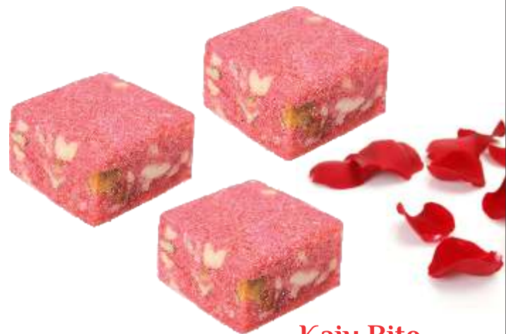
Kaju Bite Rose