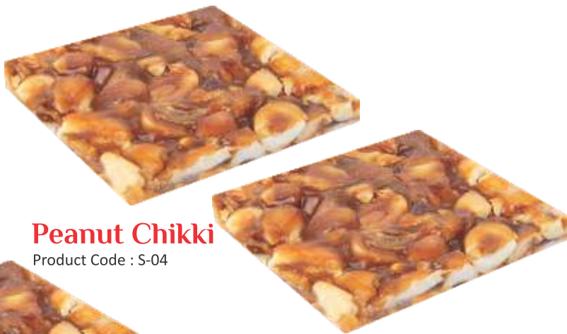
Peanut Chikki Product Code : S-04