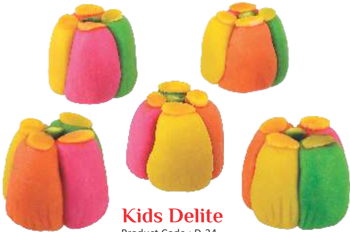
Kids Delite Product Code : D-34