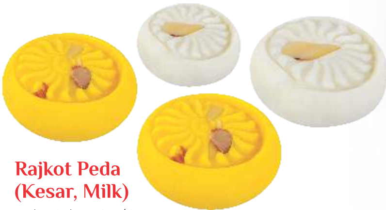
Rajkot Peda (Kesar, Milk)