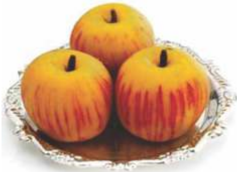
Apple Dryfruit Product Code : D-36