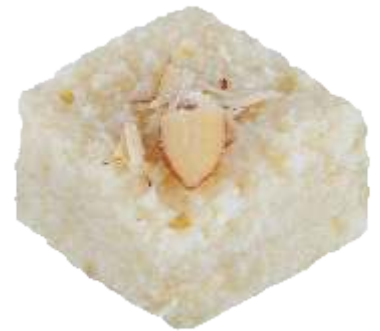
Kalakand Product Code : M-23