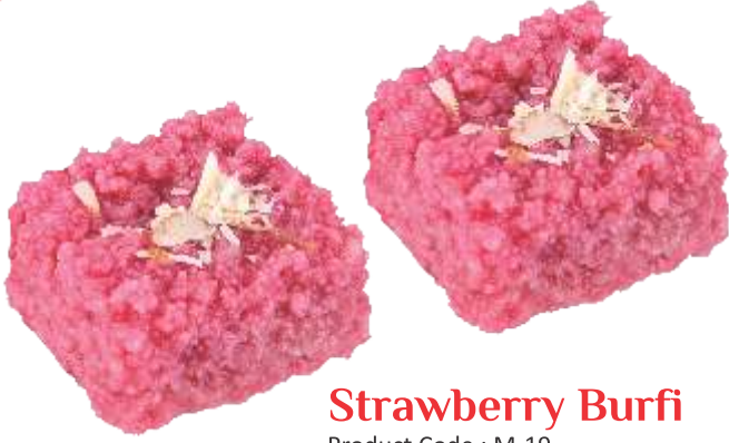
Strawberry Burfi Product Code : M-19