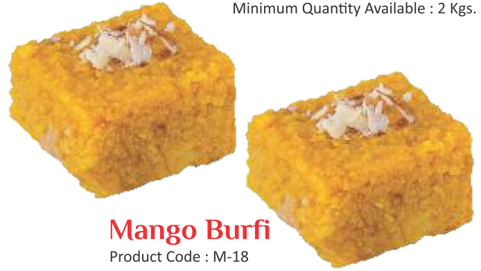
Mango Burfi Product Code : M-18