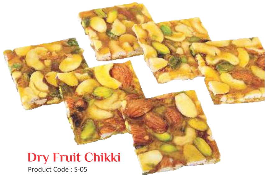
Dry Fruit Chikki Product Code : S-05