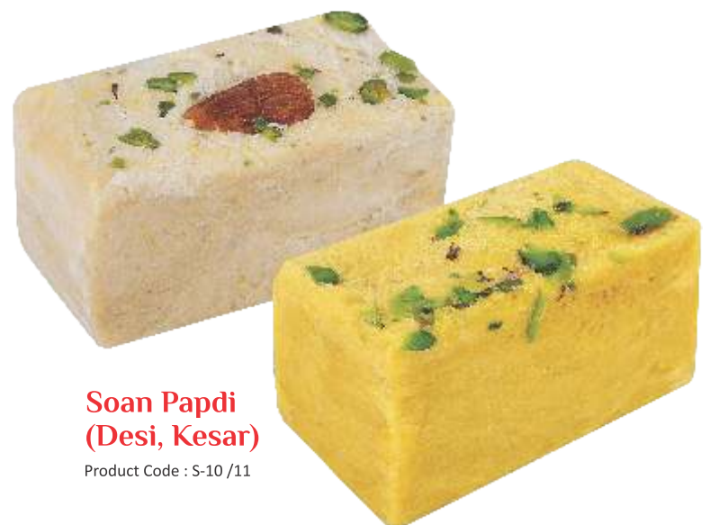
Soan Papdi (Desi, Kesar)