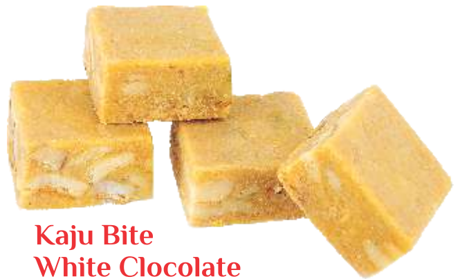
Kaju Bite White Chocolate