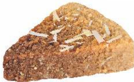
Milk Cake Product Code : M-21